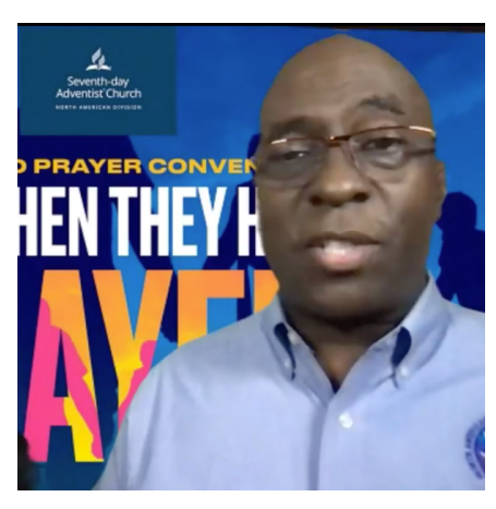
The Prayer Ministries department of the North American Division

Experience event 13 months ago, organizers quickly mobilized to hold the event online. In anticipation of the potential need to have another virtual event in 2021, planning started after the April 18, 2020 experience. This April, the PBE event was indeed held virtually. MORE