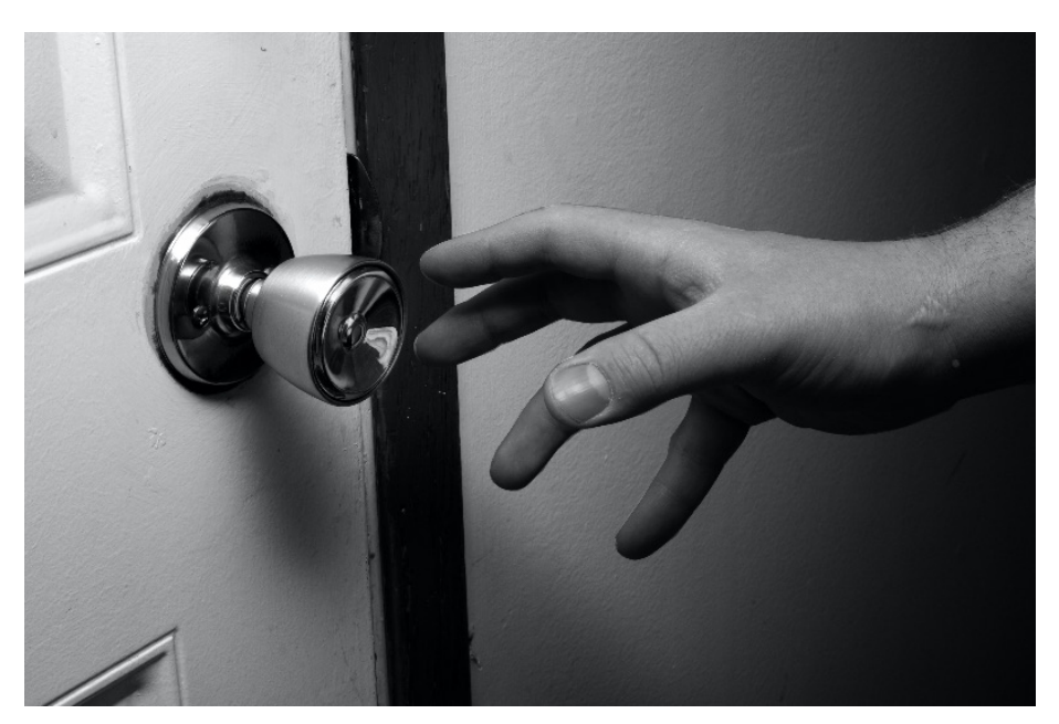
Send Jesus to the Door

""One of the big themes that popped out at me as I looked through the books of the Bible that you're studying is temptation. Tonight, I hope you [remember] to give God a chance to